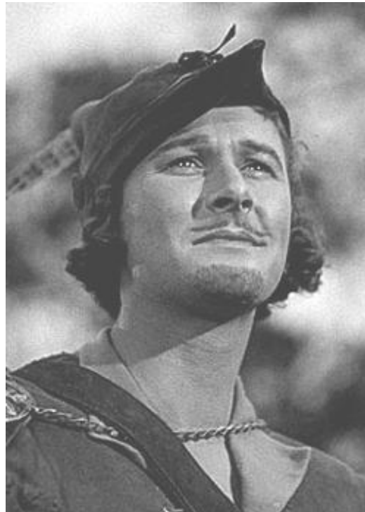
Errol Flynn, The Adventures of Robin Hood (1938)

In New Zealand, things were quieter. Multiple earthquakes in Christchurch, the aftermath of the Pike River Coal mining disaster and the Rugby World Cup sapped the energies of many. But the international economic virus that has affected so many parts of the world adversely these past months is alive and well here at home. The opening of the books by the Government in late October